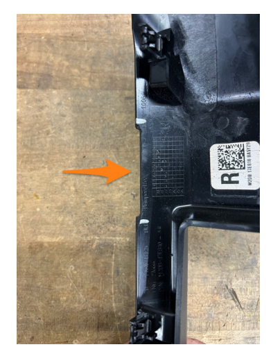
7. Reinstall the trim panel.