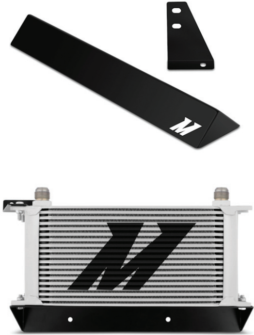
2008+ Infiniti G37 Coupe Configuration

This installation guide displays the steps for the Nissan 370Z. The steps for the Infiniti G37 Coupe installation are the same except you will use the brackets shown below: