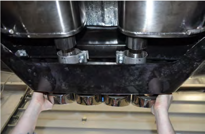
Fig. A Fig. B