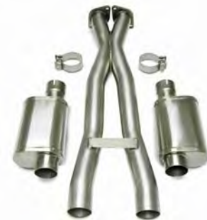
PN 14191 Sport to Touring Conversion Kit