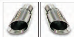
4.0" Pro-Series Tips