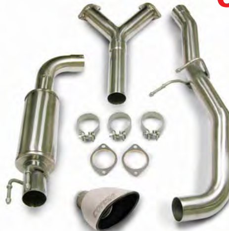
PN 14186 Sport System Single Rear Exit with Oval GTO Tip