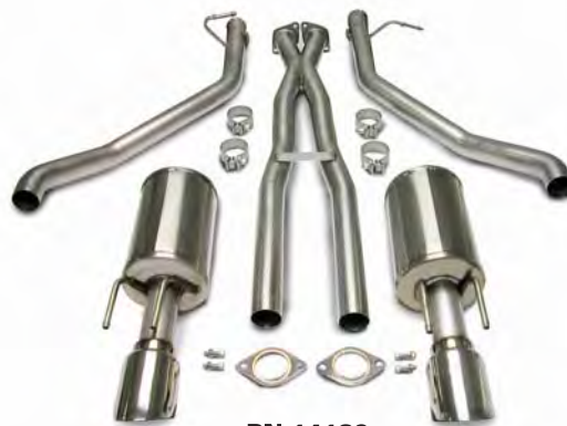
PN 14189 Sport System

Dual Rear Exit with 4.0" Pro-Series Tips