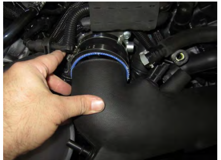
20. Press the CORSA air duct into the 3.5in sleeve.