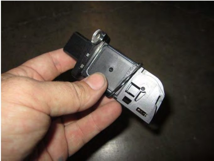
17. Remove the O-ring from the MAF sensor.