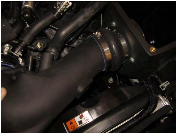
19. Press the CORSA air duct into the 4in hump hose, do not tighten the clamp at this time.