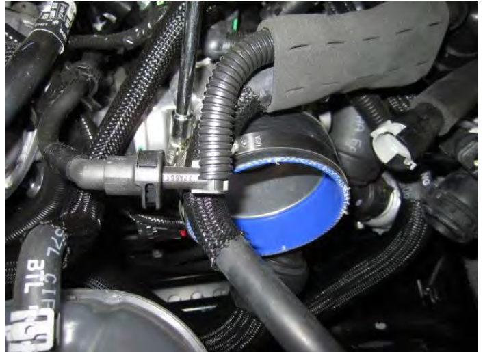
18. Attach the 3.5 x 2.5 sleeve onto the throttle body with a #56 clamp using a 5/16 socket or nut driver only.