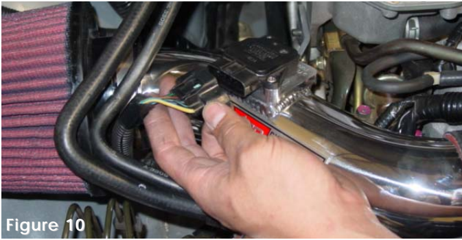
Figure 10 Press the harness clip into the mass air flow sensor until you hear it snap firmly in place.