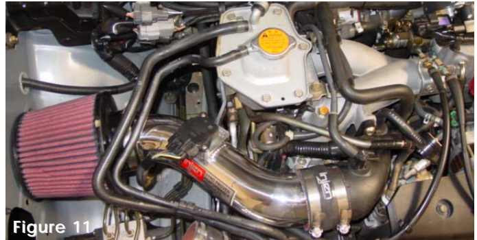
Figure 11 Congratulations! The installation is now complete.