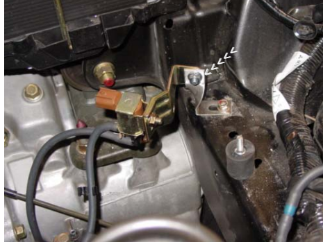
Mount the boost control solenoid bracket to the 1450T bracket. Use an m6 x m16 hex bolt and flange nut.