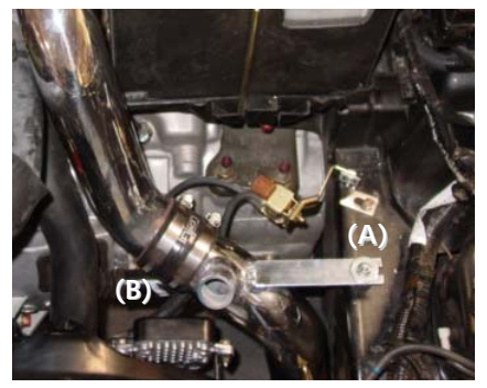
The secondary hardpipe bracket will align to the vibra-mount stud(A). Use the m6 nut and washer to hold the intake in place. Insert to top end into the 2 1/2" hose and align the intake before you semi-tighten any of the clamps(B).