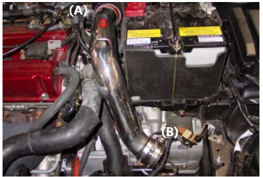
Insert the primary intake into the 90 degree hose on the throttle body, use two .312 Power-bands (A). Align the hardpiping and semi-tighten the clamps. Press the 2 1/2" straight hose over the end of the pipe and use two .312 Power-Bands (B). Tighten the clamp on hardpipe (A).