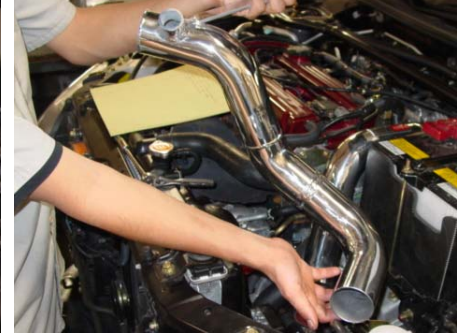
Take the secondary hardpipe and lower it into the bumper section. Insert the lower end into the stock hose on the intercooler port but do not tighten the two .312 Power-bands that are to be used.