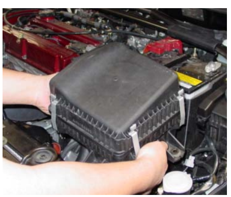
The stock air intake box is removed and the mass air flow sensor is disconnected from the air intake box to be used later in the instruction.

Remove the stock intercooler piping with the rubber with the stock hose connectors. The piping to the driver side front intercooler is removed with the exception to the connecting hose on the intercooler.