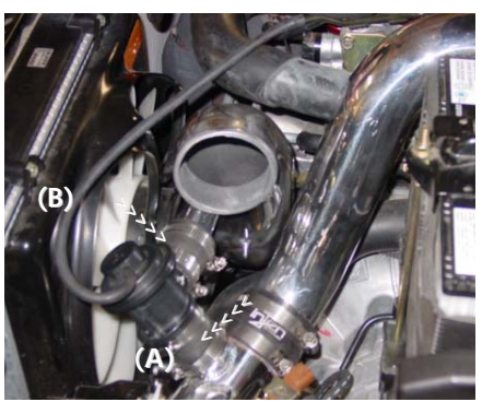
Insert the assembled blow-off valve over the large port on the intercooler pipe(B). Press the other end over the large port on the intake(B). If another manufacturers intake is being used some modification will be required.