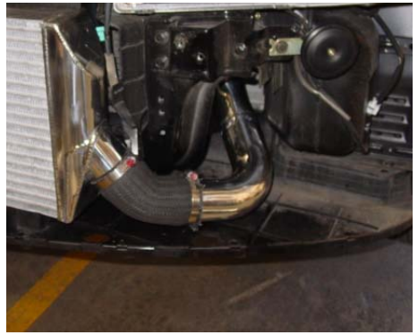
Here is a shot of hardpipe (B) connected to the stock hose on the intercooler tanks. Use two .362 Powerbands to connect hardpipe (B) to intercooler end tank.