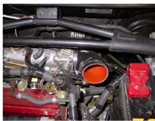
Press the 90 degree elbow on the throttle body and use two two .312 Power-Bands on the elbow. Semi-tighten the clamp on the throttle body at this time.