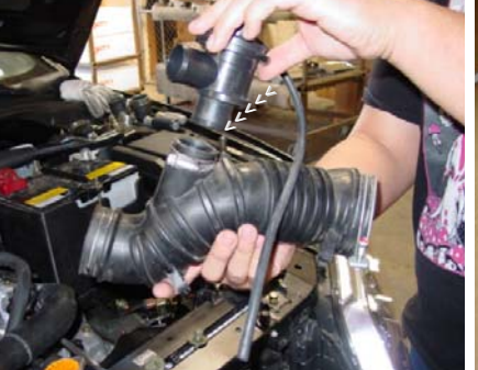
Remove the blow-off valve from the stock intake duct.