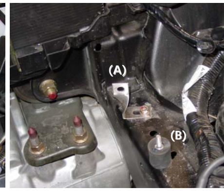
Take the small 1450T bracket and mount it to the held the air intake box and boost solenoid in place. frame of the car, use the stock bolt to secure the bracket in place(A). Screw the vibra-mount into the pre-tapped hole on the same frame as the bracket(B).

Remove the stock zinc plated brace that once