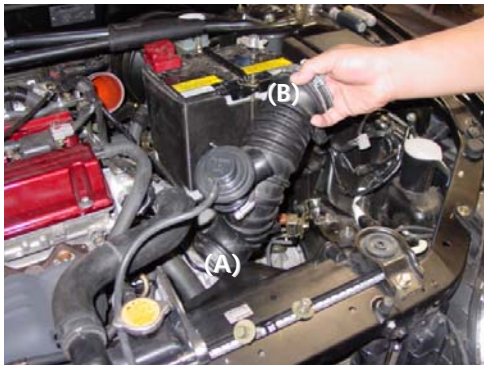
Remove the stock air intake duct connected to the turbo outlet (A) and the air intake box (B). This system must be used with an up graded intake system. This system cannot be used with the stock air intake system.