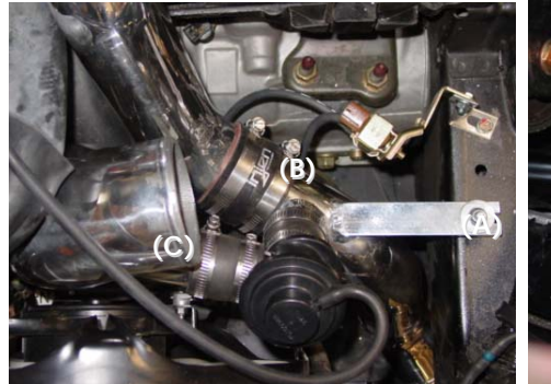
Top view of the bracket (A), blow-off valve (B) and cast intake (C) all connected and ready for the next step.