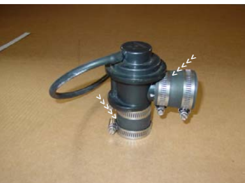
Press the new reinforced short hose over each port on the blow-off valve. Use the .024 mini clamps provided in this kit to secure the hose in place.