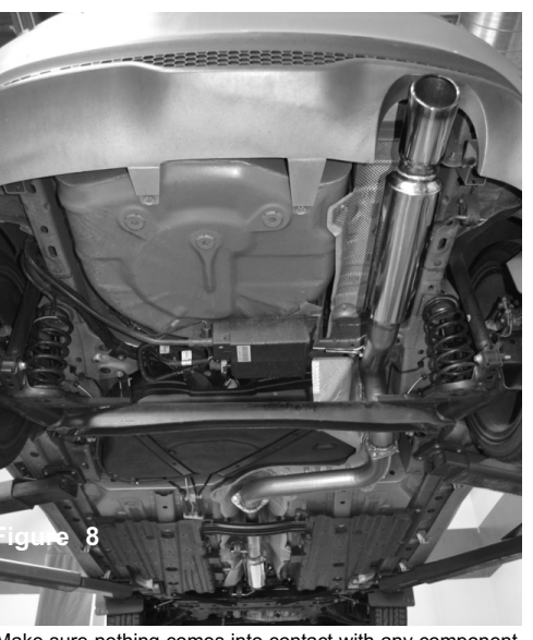
Make sure nothing comes into contact with any component and then make your final adjustments to the entire exhaust system. Use a 14mm socket and rachet secure all the M10 nuts and bolts.

Congratulations! You have just completed the installation of the Injen Cat-back system. Periodically, check the alignment of the exhaust, normal heat cycles can cause nuts and bolts to come loose. Failure to check the alignment and adjust the exhaust can cause damage that will void the warranty.