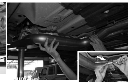
Once the mid-pipe is in place. Use provided 76mm gasket and 2 bolts and nuts. Do not tighten

Install the rear section and postion to mid-pipe. Use provided 76mm gasket and 2 bolts and nuts. Place the metal hangars into the rubber isolators Now position and tighten using 14mm socket and wrench. Tighten nuts on flange from step 4. Re-install the bracket from step 2. make sure there is clearance. Re-adjust if necessary. Note:Flanges have room for rotation, if exhaust comes close to touching any other component, adjust and move flanges to get proper fitment.