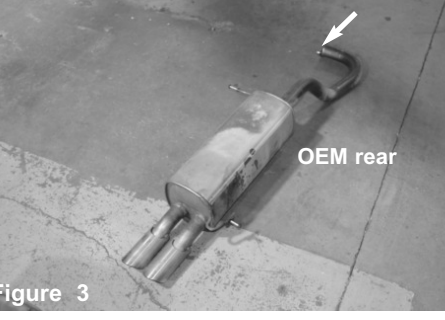
This will allow for easy re-installation of the factory exhaust if needed.

Loosen and remove the frame bracket using 13mm socket Cut exhaust in the middle and remove the rear section. and ratchet. Remove the bracket.