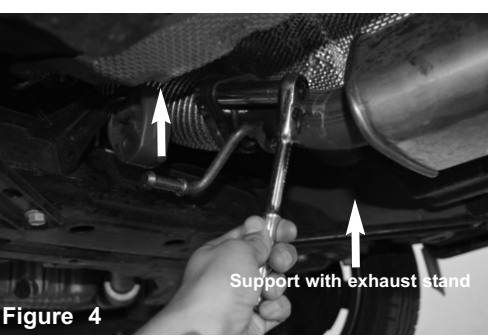
Loosen the 2 15mm nuts on OEM downpipe flange using ratchet and socket. Save nuts and gasker for later use. Remove the factory front section.