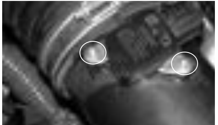
Loosen and remove the two sheet screws that fasten the MAFS to the sensor housing.