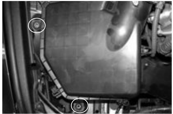
Loosen and remove the two bolts that secure the air box cleaner over the grommets.