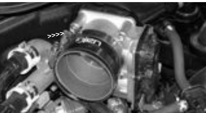
Press the 3 straight hose over the throttle body and use two power clamps. Use two power-clamps and be sure to tighten the clamp directly over the throttle body end for now.