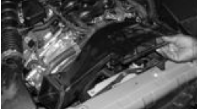
The front air scoop is now removed from its current location for now.