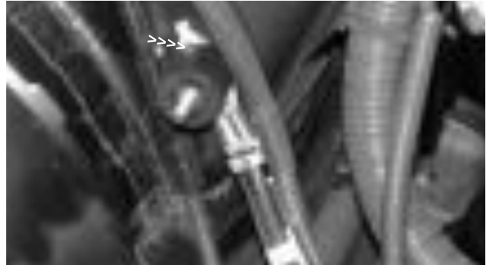
Screw vibra-mount firmly into the grounding wire pre-tapped hole until it bottoms out. Make sure the vibra-mount snug and tight over the grounding wires before moving on.