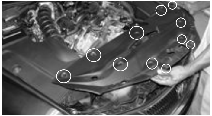
Depress the center stem on the plastic clip and remove all 11 clips from the radiator top shroud. Once all clips have been removed continue to remove the plastic front shroud.