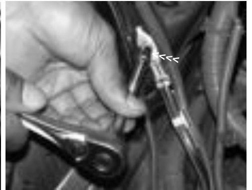
Use a 10mm socket and ratchet to remove the screw that secures the grounding wire to the fender well.