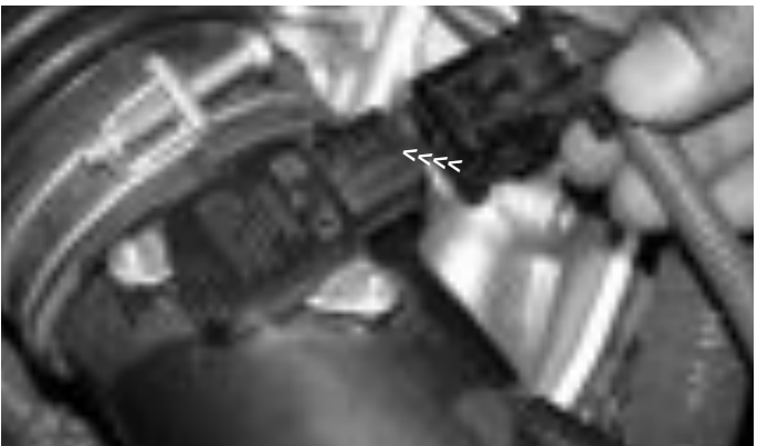
Disconnect the electrical sensor connector from the MAFS.