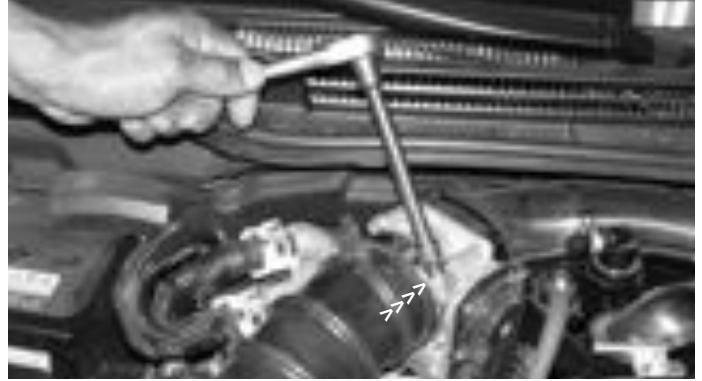
Loosen the only remaining metal clamp which secures the air duct to the throttle body as shown above.