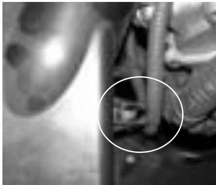
Here is a close up of the sensor harness removed from the air box clip.