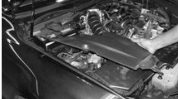
Now, continue to remove the side accessory cover which lays over the air intake box cleaner.