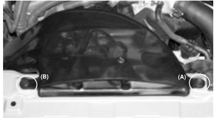
Loosen and remove one bolt (A) depress and pull the last remaining plastic clip (B) now holding the air scoop in place.