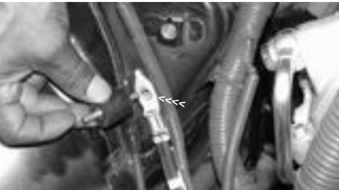
Once the screw has been removed, continue to place the vibra-mount into the pre-tapped hole as shown above.