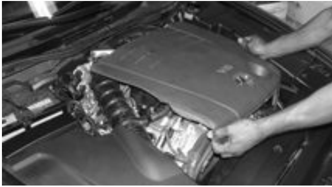
Pull the engine cover from the intake manifold by firmly pulling in a upward motion.