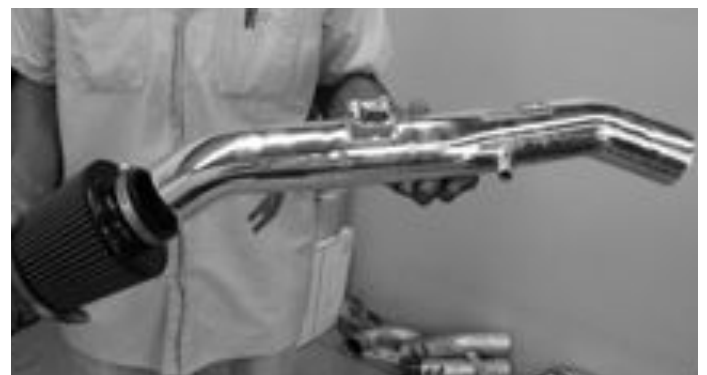
Slip the three inch filter over the end of the intake until it butts up against the filter stops. Once the filter has been firmly placed, continue to tighten the filter neck clamp.