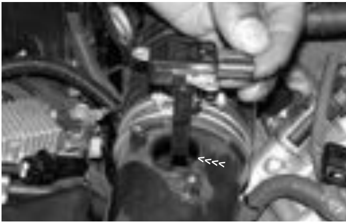
Remove the MAFS from the sensor housing as shown above. Set the MAFS to one side to be installed later in the instructions.