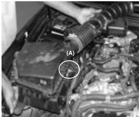
Lift and Pull the air box cleaner from the lower grommets. Before pulling the air box out, unclip sensor harness from the air box side clip (A).