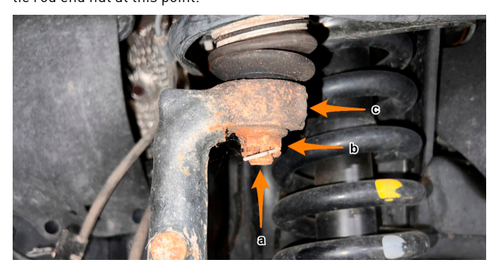
07. Tie up the top end of the knuckle to the lower control arm to keep it from hanging on the brake hose.

06. Using pliers, remove the cotter pin (a) from the upper ball joint end castle nut, then use a 19mm socket to loosen the nut (b). Leave the nut partially threaded on for now. Using a hammer, hit the knuckle in spot (c) until the taper pops loose. Pry down on the upper control arm and fully remove the nut. You can also fully remove the tie rod end nut at this point.